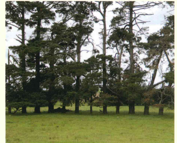
A barren place for stock and wildlife