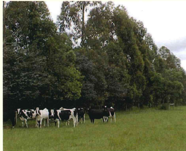
Effective shade and shelter for livestock, and great Habitat for local wildlife